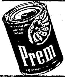
Table Ready Meats . . . . .

JUST THE THING FOR THOSE HOUSECLEANING DAYS