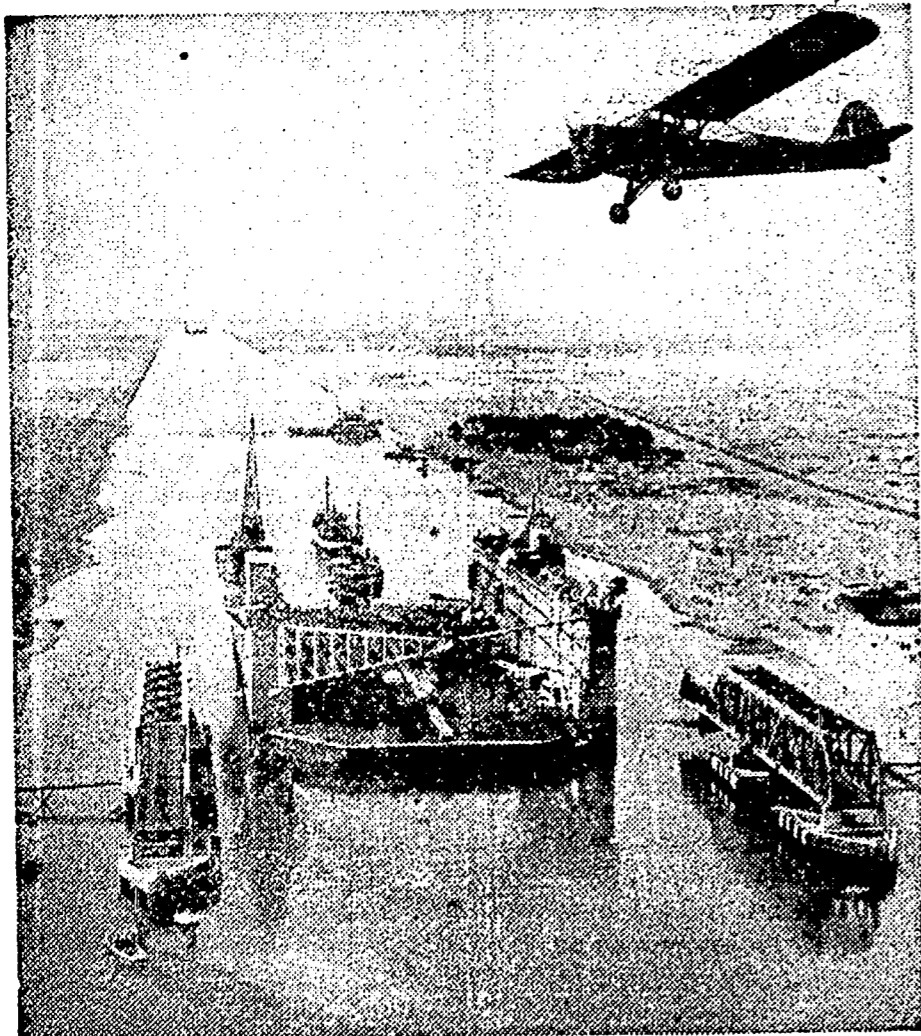
A dock built by the British in Bombay intended for the use of the Royal Navy in Malta, was recently towed there by Admiralty tugs. It is so large (it can accommodate a 50,000 ton ship) that it had to be cut in two for passage through the Suez Canal. This picture shows the first half of the dock being warped through the El Ferdan swing bridge while a RAF spotter aircraft flies over the top. The second half of the dock can be seen approaching up the Canal in the distance.