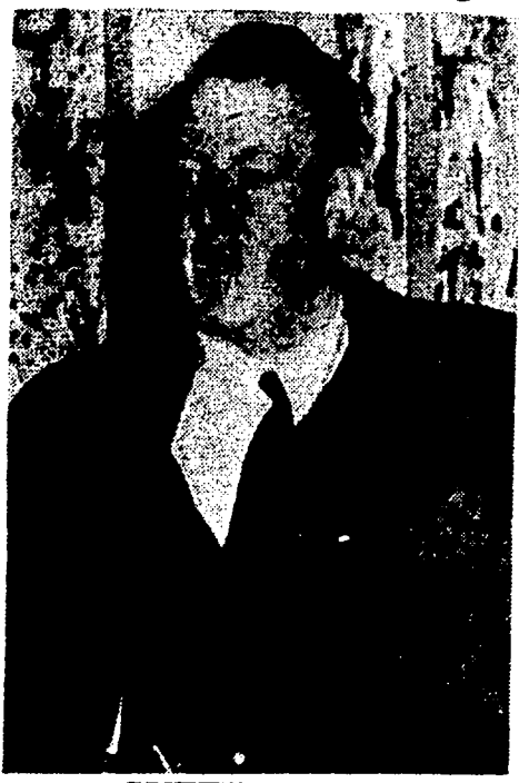
SUFFERS FALL Cpt. Charles Cates, mayor of North Vancouver, who was

a member of the party making the pre-inaugural trip over the PGE line via the new Dayliner service, suffered a slight concussion when he slipped and fell as he was leaving the train in North Vancouver this morning.