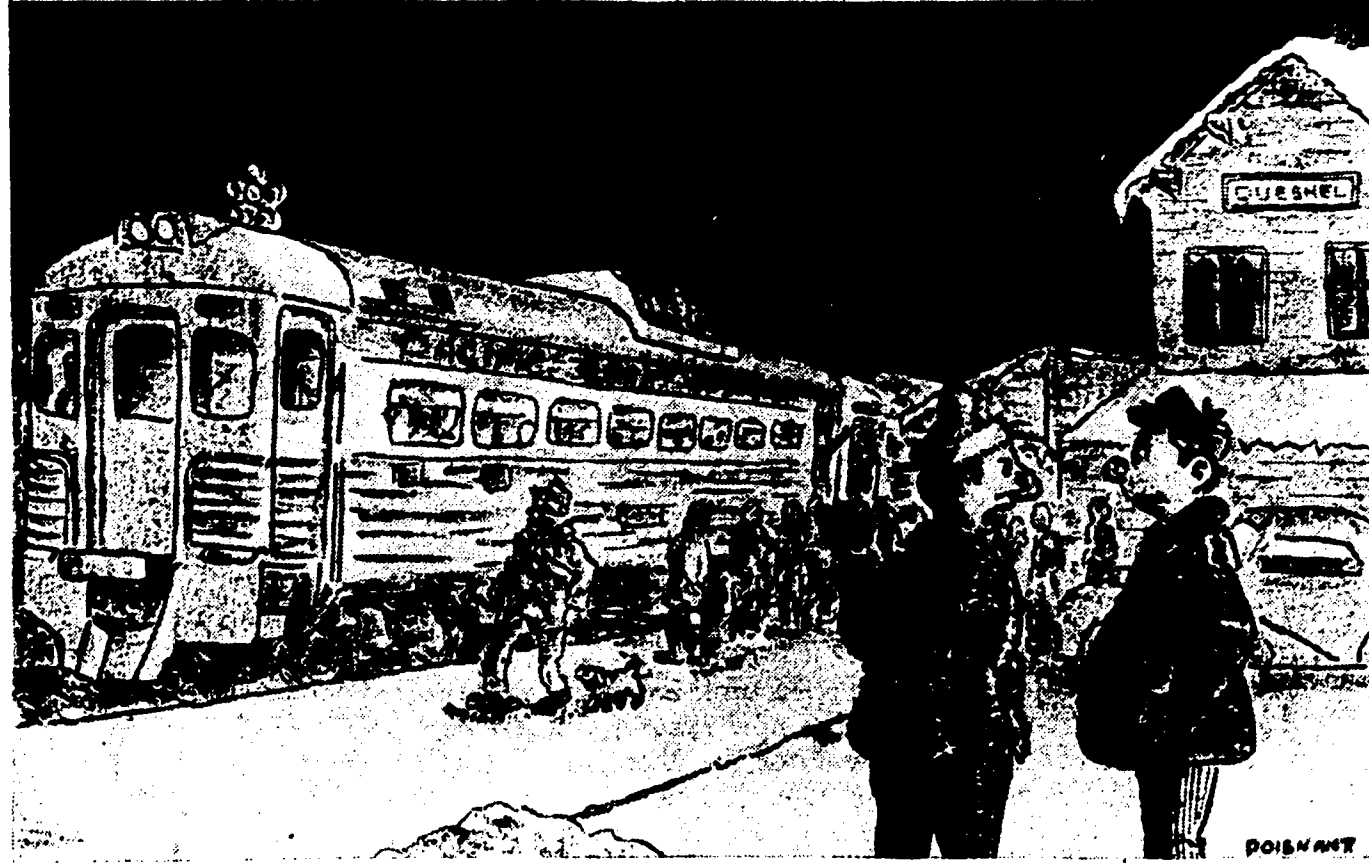
"... but it sure ruins those old PGE jokes!"

peacetime record. Estimated expenditures for the current fiscal year are $4,657,000,000. The all-time high was $5,245,000,000, reached in 1944-45 during the Second World War.