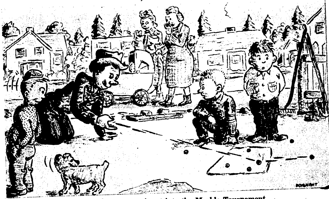
One guy who sure won't get into the Marble Tournament