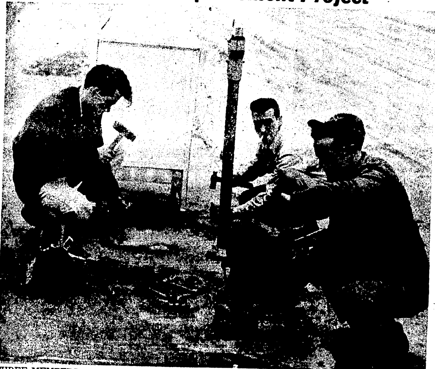
THREE MEMBERS of the Quesnel Jaycees are seen above drilling holes to anchor down the