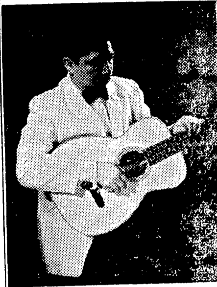
Quesnel Overture Concert members.