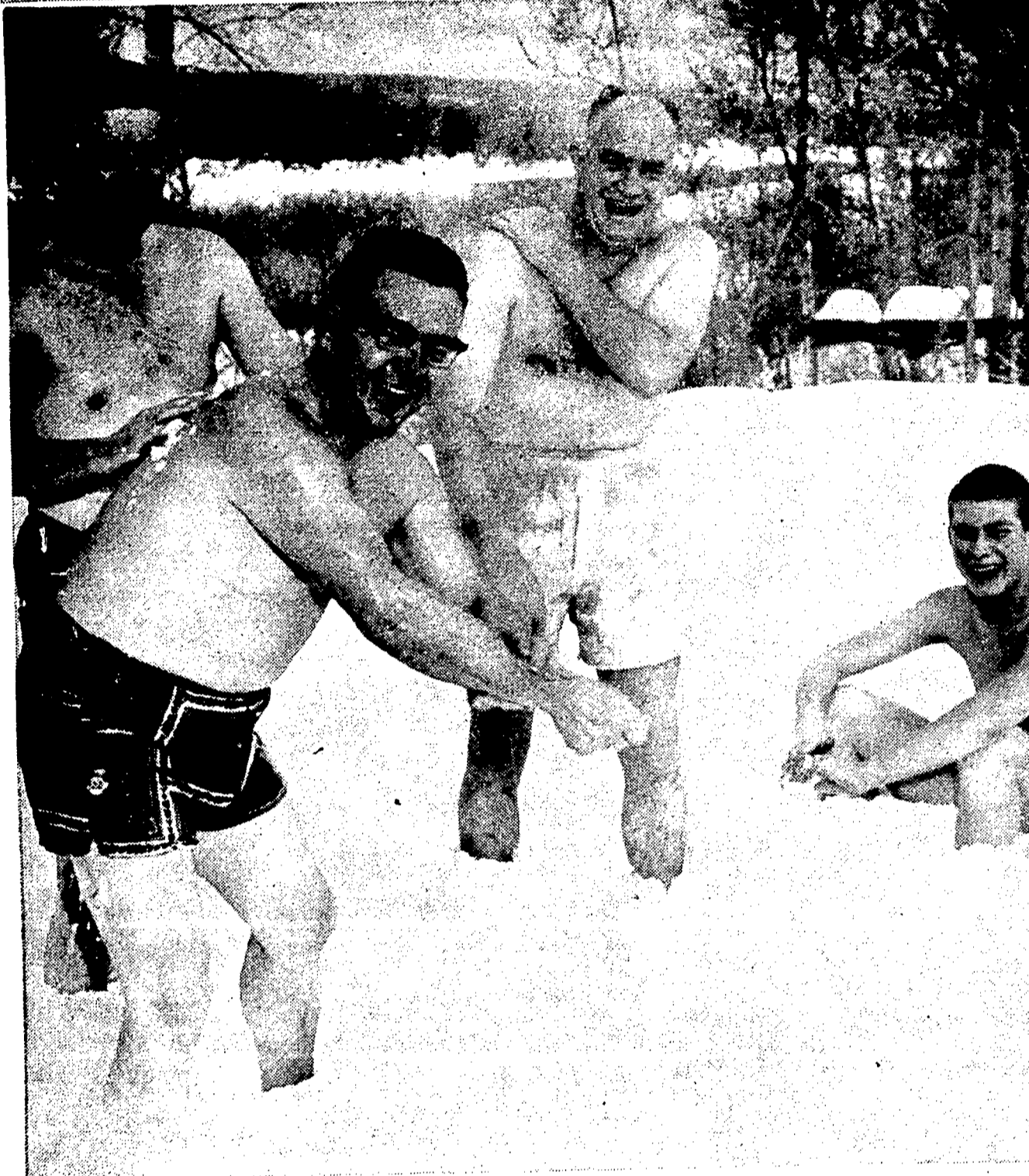
FROM 170 degrees in the steam on New Year's morning, back room to below-freezing in the and forth, from hot to cold, all snow, went three stalwart men as the result of a bet during